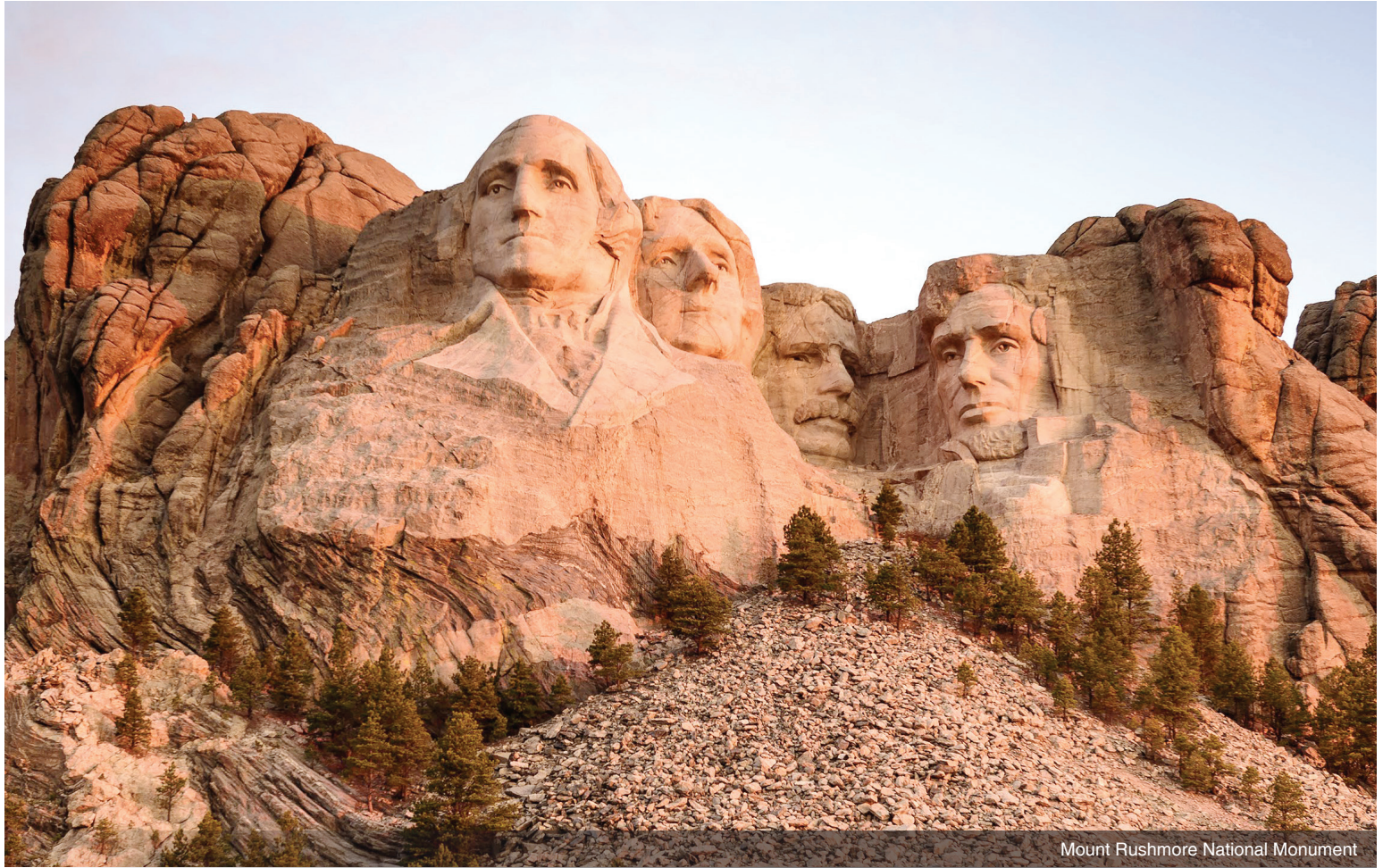
Mount Rushmore National Monument