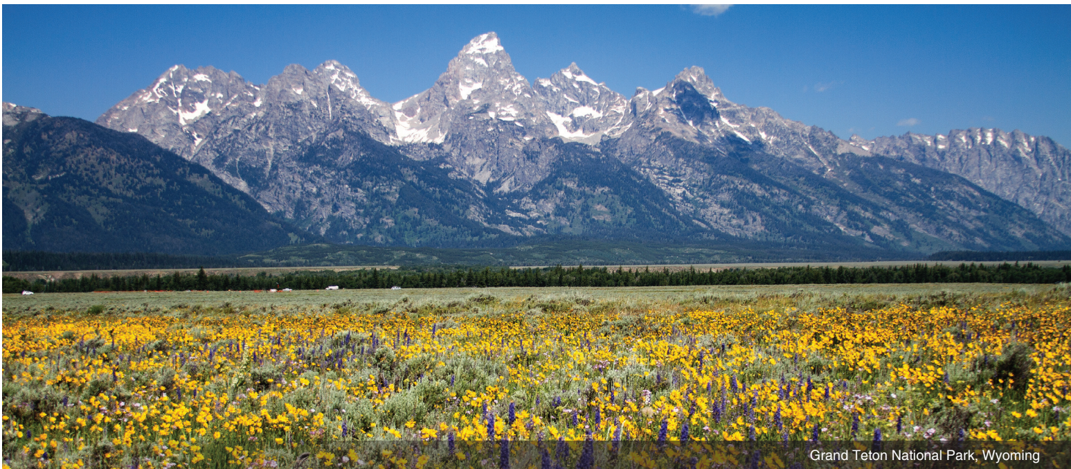
Grand Teton National Park, Wyoming