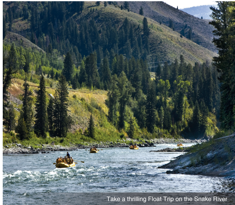
Take a thrilling Float Trip on the Snake River